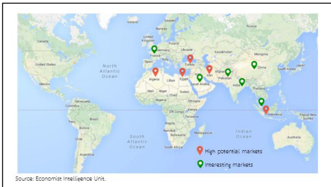
Fig 3. Overview of the Potential and Interesting Halal Food Market in the World.

Indonesia. This means that if the number of Indonesian population in 2017 about 256,603,197 inhabitants, then the number of Muslims about 218,112,717 inhabitants. This number is one third of the world's Muslim population, which is 3 persen. The domestic halal food market of Indonesia is quite large, so it is actually quite easy for Indonesian halal food producers to market their food products in the domestic country considering the need is also quite large. In addition, with the globalization and the shifting of understanding and trend in the use of halal food products, so that the market share is not only limited to Muslim countries, but also there are other potential markets with non-Muslim consumers. This is shown in Figure 3 below: