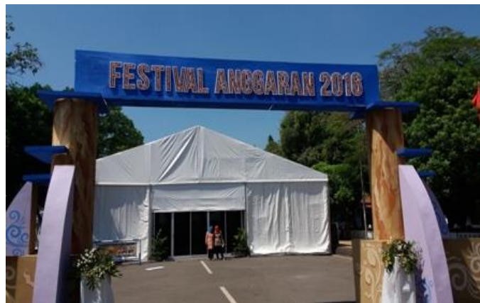
Fig. 3. Festival Budget 2016.

Budget Festival is communication media in order to realize the transparency of local budget utilization and recent working plan for a certain period that involved money, which is presented to the public as a routine activity of Batang regency. Transparency of APBD management through Budget Festivals as an implementation of governance according to Law No. 28/1999 concerning the governments enforcement transparent, accountable, effective and effisien. The figure 3 is pictures of the festival budget 2016.