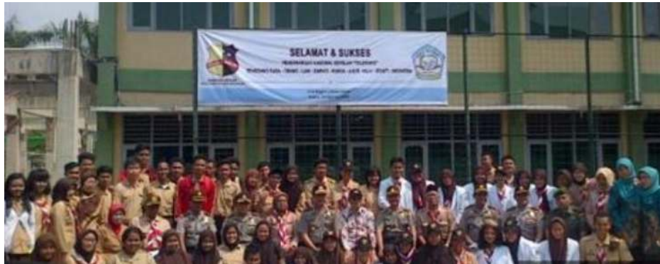
Figure 5. Socialization Cinta Pancasila Website

In Tolerance Schools will be given training, counseling and competitions. School Tolerance participants are 50 people chosen by the school representing class X, XI and class XII. Socialization as shown in Figures 5 and 6.