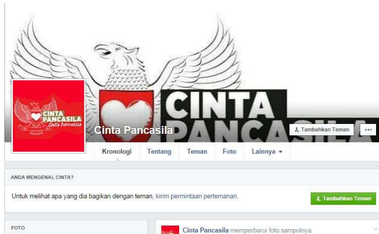
Figure 3. Facebook page on the Cinta Pancasila Website

The Cinta Pancasila website is also linked to other social media, from interviews of high school students, obtained results where many become active users on facebook and twitter, the social media that is linked to the Cinta Pancasila Website is facebook and twitter. Both Facebook and Twitter can be accessed directly from the Cinta Pancasila Website, because the website has provided a menu that can be directly connected to the Love Pancasila facebook and Twitter Love Pancasila. Facebook front Love Pancasila and Twitter Love each Pancasila as in Figures 3 and 4