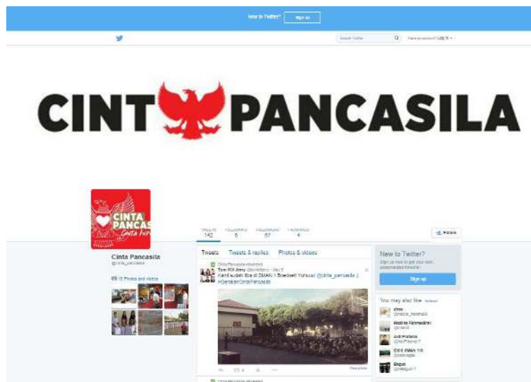
Figure 4. Twitter page on the Cinta Pancasila website