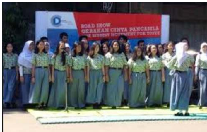
Figure 6. Socialization Gerakan Cinta Pancasila

In carrying out training activities and socializing the use of the Cinta Pancasila Website for students and teachers, it requires good planning and is adjusted to the readiness of the time and availability of schools, school facilities, readiness of the module and the right time for socialization training, because it does not interfere with activities learn how to teach.