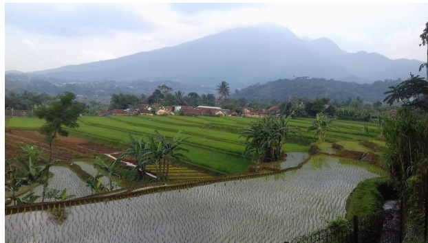
Figure 1. Gunung Bunder 2 Village

Gunung Bunder is the one of the villages in Pamijahan District, Bogor, West Java. The climate of Gunung Bunder Village like other in the tropics, has a dry and rainy climate (Yuviani, 2022), this has a direct influence on the soil patterns in Gunung Bunder Village. The climate of an area greatly influences life, a view of Gunung Bunder Village 2 as in Figure 1 below;