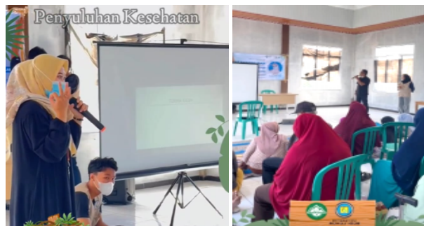
Figure 6. Counselling

Preparation of the activity since 06.00 where the committee has started gather to prepare for the implementation. After that, the committee representative picked up the health team at the Health Center to start a briefing to align the perception of the activity between the health center committee and local respondents. Furthermore, the core activity began at 09.00 with counseling and interactive discussions about the importance of maintaining cleanliness for health. Many residents asked about the relationship between cleanliness and health, how to deal with waste so that it does not pile up and how to maintain health caused by the accumulation of waste. All questions were answered clearly and discussed with health counselors and local officials so that the problem could be resolved together. Residents need correct information about health and certainty regarding waste disposal. The inspection activity is as seen in Figure 6.