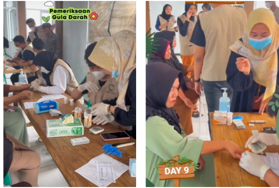
Figure 8. Blood test

Data of residents who under health checks are stored digitally. Conventional data storage media are converted into digital storage. This digital-based data recording system is expected to make it easier for medical officer to search when residents seek treatment at the health center. The data of residents that are stored include those in Table 3 below