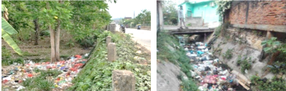
Figure 2. Piles of waste

good for health (S., 2023). Public awareness of health is still very minimal, this is indicated by the public's lack of concern for skin diseases, stomach ache and even ARI which often attack residents (E., 2018). The environment polluted by waste can be seen in Figure 2. as follows