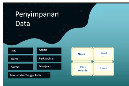
Figure 10. Data input

The interface layer for inputting data, made simple to make it easier for officers to input data. In addition, data management is only related to health data. The data input layer display interface is as shown in Figure 10. as follows,