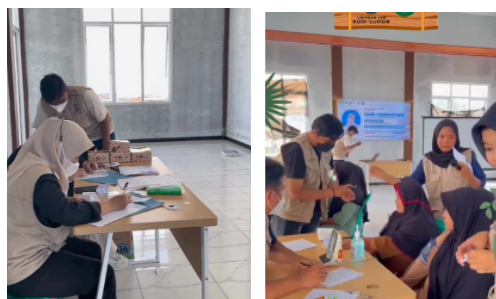
Figure 7. Data recording

After the counselling was completed, it was continued with a health check. Before the blood test was carried out, residents were asked for personal data, health history and daily lifestyle. Resident data collection was assisted by students, as seen in Figure 7. The following