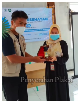
Figure 3. Giving souvenir

The medical assistant is a very important and very needed to increasing public awareness, through counselling and socialization in health checks. A companying lecturers also responsible and called to help increase public awareness in maintaining health (Situmeang, 2020). This activity is a community service by lecturer as a manifestation of the Tridharma. Students also active in this activity, students learn to apply their knowledge in society. The role of students in the activity by representing in giving souvenirs from the university to the Cibening Health Center, seen in Figure 3. below;