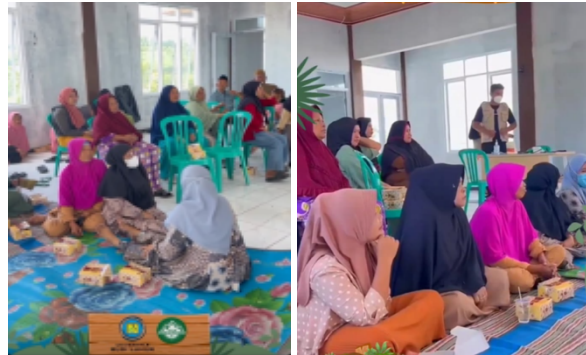
Figure 5. Community enthusiasm

Preparation of the activity since 06.00 where the committee has started gather to prepare for the implementation. After that, the committee representative picked up the health team at the Health Center to start a briefing to align the perception of the activity between the health center committee and local respondents. Furthermore, the core activity began at 09.00 with counseling and interactive discussions about the importance of maintaining cleanliness for health. Many residents asked about the relationship between cleanliness and health, how to deal with waste so that it does not pile up and how to maintain health caused by the accumulation of waste. All questions were answered clearly and discussed with health counselors and local officials so that the problem could be resolved together. Residents need correct information about health and certainty regarding waste disposal. The inspection activity is as seen in Figure 6.