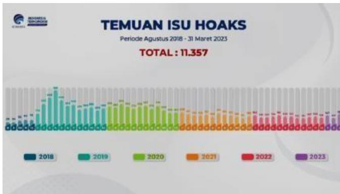
Fig. 23.1. Content Complaints, 2018 – 2023

In Indonesia, hoaxes have been rife since 2014, when the presidential election campaign was on social media. Hoaxes are popping up and dropping the image of political opponents, as black campaigns. Based on the annual recapitulation, Kominfo received 733 hoax content complaints throughout 2018 on the instant messaging application. Meanwhile, when viewed from August 2018 to January 21 2019, Kominfo received hoax reports that spread on WhatsApp as many as 43 contents.