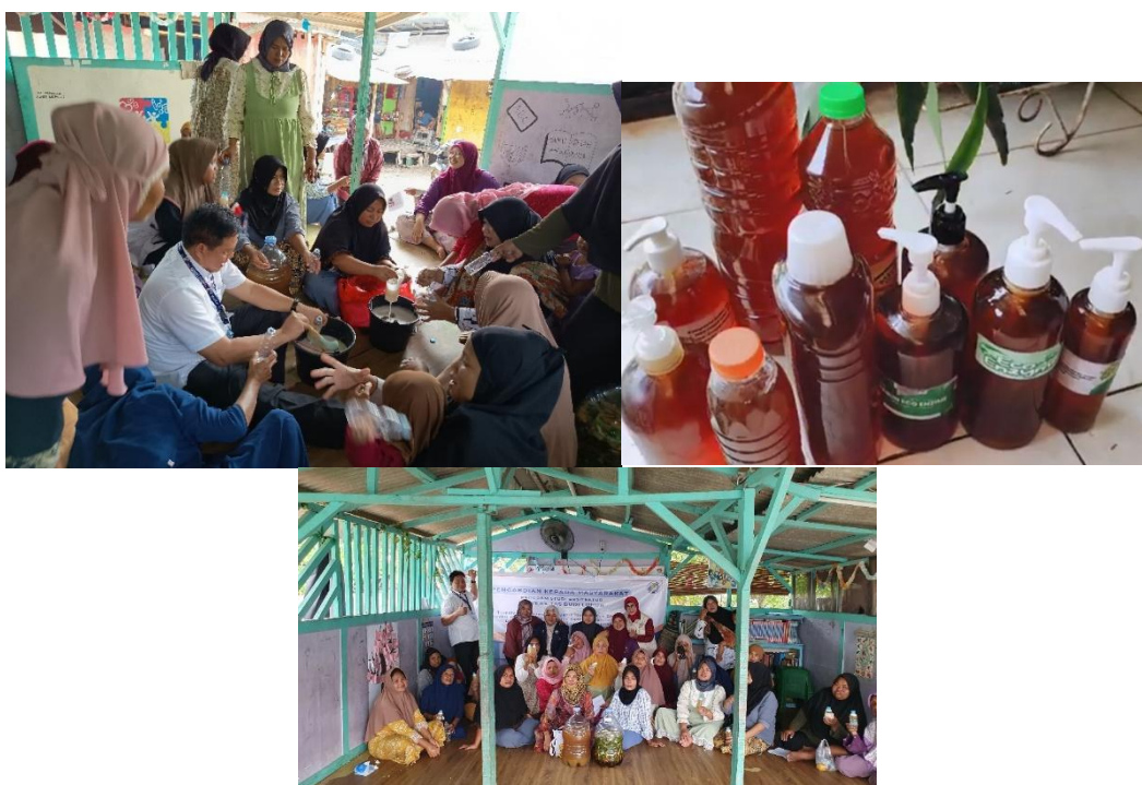
Figure 6. Result of packaged liquid detergent

The public is taught simple packaging techniques using clean, used plastic bottles, labeled with the product name, and including information on ingredients and instructions for use. The following is a picture of liquid detergent that has been packaged.