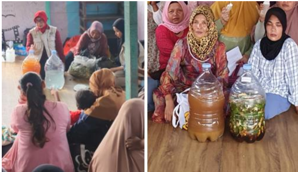
Figure 4. Eco-enzyme Manufacturing Process

The process of rotting and fermenting meat is different from that of plants. Meat will quickly rot and produce pathogens at unregulated temperatures. The next ingredients that need to be prepared are brown sugar/palm sugar/molasses, and water. The tools needed are plastic bottles/buckets/airtight barrels that expand easily. Avoid using glass containers because the fermentation process produces a lot of gas. Fermentation Process: Once the necessary materials and equipment are ready, the next step is fermentation. After 3 months, filter the eco-enzyme using gauze or a sieve. The residue can be reused for a new batch of production by adding fresh waste. The residue/dregs can be dried, blended, and buried in the ground as fertilizer. The remaining EE dregs can be used for several purposes, such as: as a starter (ease) or to help speed up the subsequent EE production process. The following are the activities for making eco-enzymes: