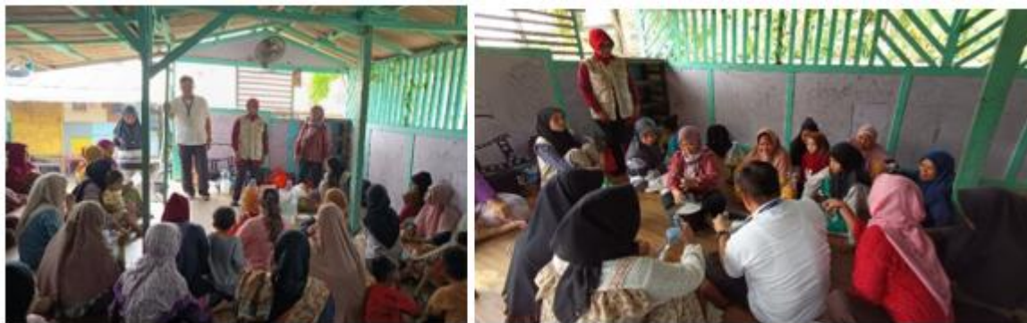
Figure 5. Liquid detergent manufacturing process

stirred until homogeneous, and then tested for foam and cleaning power on light laundry. The result: a liquid detergent with adequate cleaning power, stable foam, and is safer for the skin and the environment.