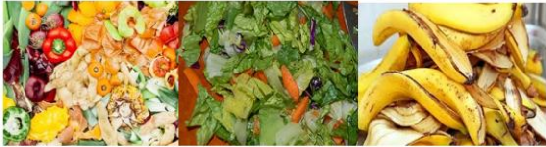
Figure 3. Fruit and vegetable peels for Eco Enzyme ingredients

The process of rotting and fermenting meat is different from that of plants. Meat will quickly rot and produce pathogens at unregulated temperatures. The next ingredients that need to be prepared are brown sugar/palm sugar/molasses, and water. The tools needed are plastic bottles/buckets/airtight barrels that expand easily. Avoid using glass containers because the fermentation process produces a lot of gas. Fermentation Process: Once the necessary materials and equipment are ready, the next step is fermentation. After 3 months, filter the eco-enzyme using gauze or a sieve. The residue can be reused for a new batch of production by adding fresh waste. The residue/dregs can be dried, blended, and buried in the ground as fertilizer. The remaining EE dregs can be used for several purposes, such as: as a starter (ease) or to help speed up the subsequent EE production process. The following are the activities for making eco-enzymes: