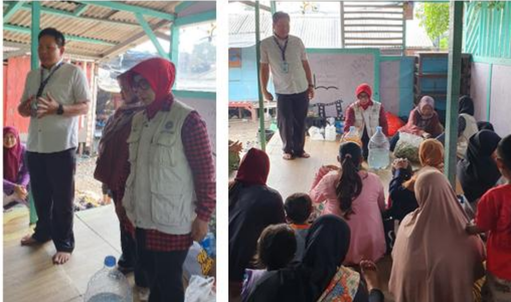
Figure 2. Socialization regarding household waste management Source: PkM Team Documentation, 2025

The ingredients used to make eco-enzymes include household organic waste, pineapple and orange peels, brown sugar or molasses, and clean water. In the first process, the ingredients are mixed in a 3:1:10 ratio (organic waste: sugar: water), then fermented in a closed container for 3 months. The resulting fermentation product is a brown liquid with a distinctive fermented aroma.