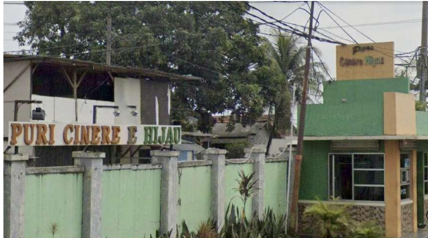
Figure 1. Partner Location

The following are some photos that illustrate the situation at Puri Cinere Hijau Housing: