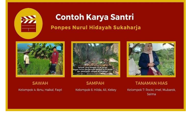
Figure 6. Videography and Video Editing Training