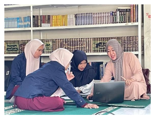
Figure 4. Training to admin/bookkeeping staff

Finally, an evaluation should be accomplished to understand the training material. This evaluation aims to ensure that trainees have a good understanding of the material that has been delivered and can implement it correctly in bookkeeping. By carrying out all these activities, hopefully, the administration of simple bookkeeping digitization can be carried out efficiently and effectively by the staff at the Pesantren Nurul Hidayah.