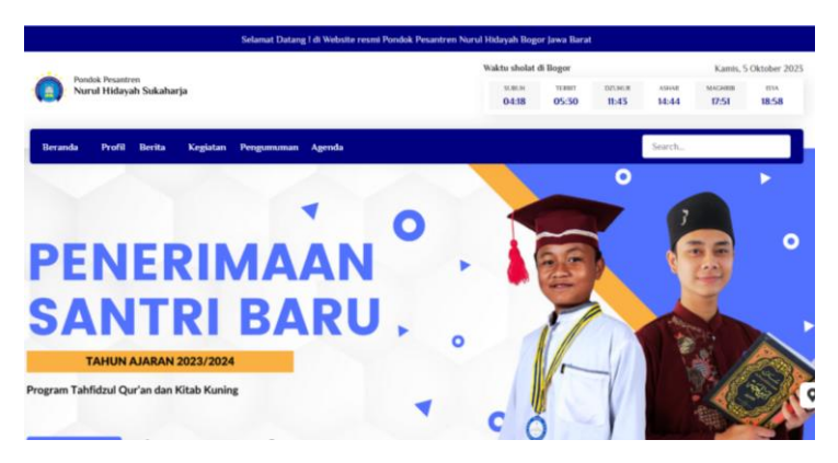
Figure 8. Website Home Page