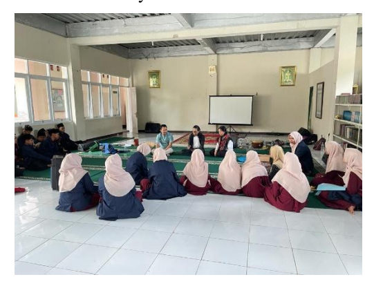
Figure 5. Digital Literacy Briefing