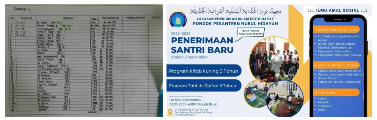
Figure 1. Administration Records

Another hassle due to manual recording is when the finance staff has to make receipts. Every student who pays instalments for clothes, books, or other fees must be given a receipt as proof. A case that often occurs is the loss of receipts by the students when going to pick up books or clothes. The financial staff was forced to reopen the general ledger to check whether the student had paid off or not. This causes the service to only take some time because everything is done manually.