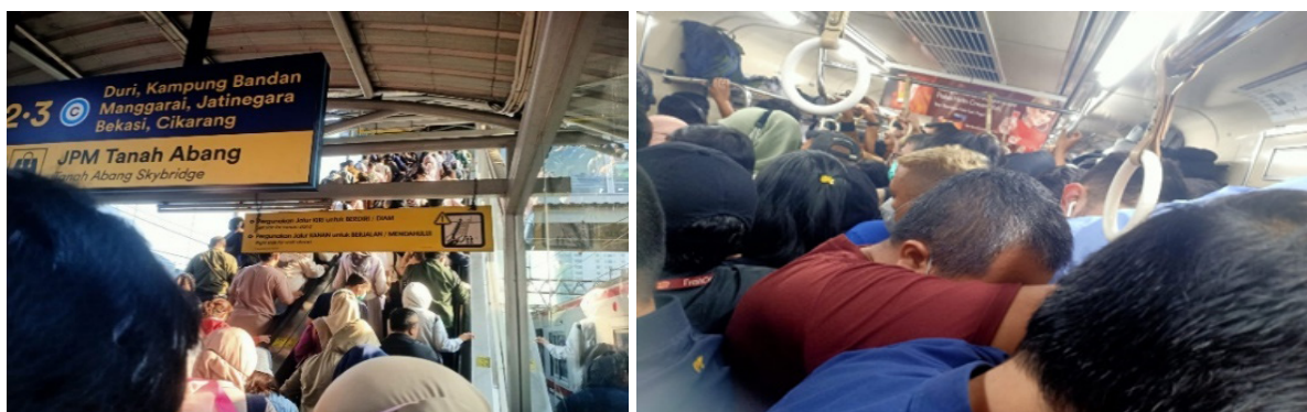
Figure 1. Working hours on the commuter line Jakarta

The incidents of sexual harassment that they experienced caused trauma in their activities because what they experienced occurred in 2021 and 2022. The trauma conditions experienced by them provide a sense of security and comfort in traveling using the commuter line, determined by the choice of carriages with security guards.