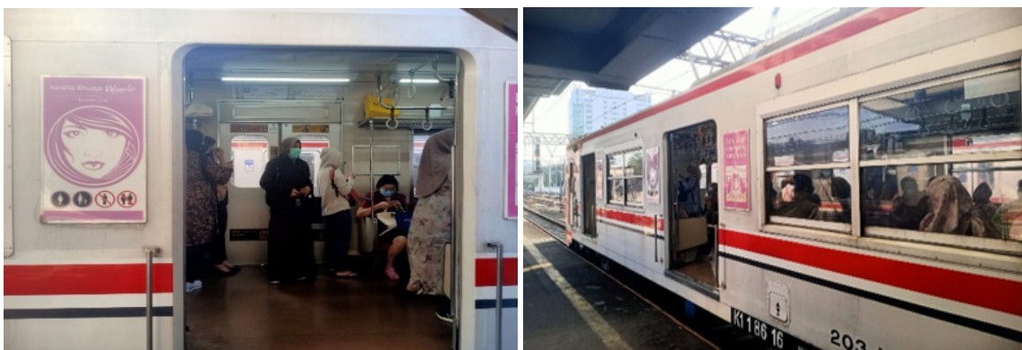
Figure 2. Commuter line, women’s carriage

The reasons and explanations are as follows: Satisfaction and comfort of using the women-only carriage is due to the belief factor of fellow women feeling safe. This perception encourages female passengers to jointly create a quality transportation space and utilized the facilities provided by the commuter line as a privacy space for women. Satisfaction and comfort are influenced by the presence of security officers in the women-only carriage. There is no difference in security between the women-only carriage and the mixed carriage (men and women). Passengers in the women-only carriage seem to be unconcerned and unfriendly to fellow female passengers. Passengers in the women-only carriage sometimes lack empathy for elderly passengers. Passengers in the women-only carriage push each other and overlap during commuting and leaving hours.