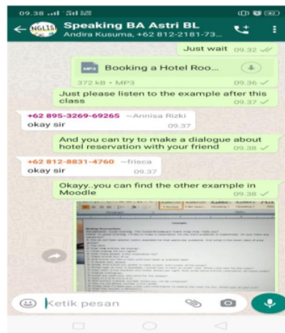
Figure 2: Whatapp Messenger for Speaking Learning

The student could upload their assignments to WhatsApp messenger in this folder. They could send the works in a file format based on the lecturer's instruction. Figure 2 below showed interaction in learning to speak using WhatsApp messenger: