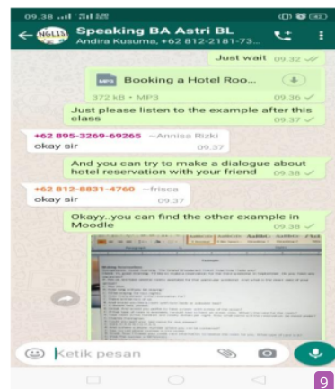
Figure 2: Whatapp Messenger for Speaking Learning

The student could upload their assignments to WhatsApp messenger in this folder. They could send the works in a file format based on the lecturer's instruction. Figure 2 below showed interaction in learning to speak using WhatsApp messenger: