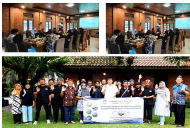
Figure 2. Tour Guide and Al Quran Pillar Training at Djembar Venue Bogor

The Tour Guide training given to ten tour guides and the head of the Gunung Padang Cultural Heritage was effective and conducive. The target of 100% of Pokdarwis getting additional knowledge was achieved. The initial target was 13 Pokdarwis, but only 10 people could leave the tourist location, because the others had to stay at the location.