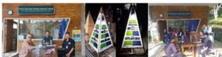
Figure 3. Location of Infographics, Sowan Wisata Clinic and Tourist Information Center