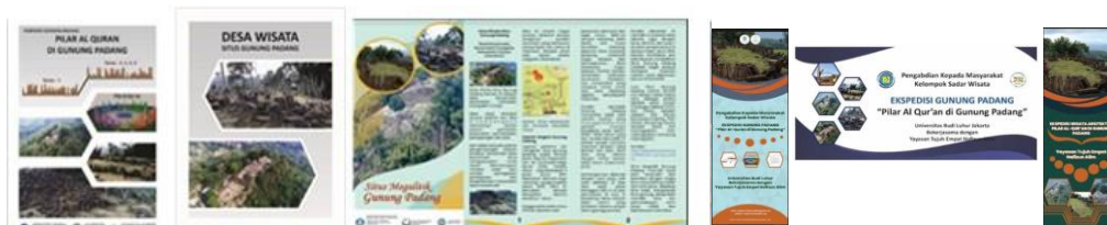
Figure 4. Tourism Attribute Products in the form of General Booklets, Religious Booklets, Brosures Roll banners and Banners

By making these tourism attributes, the increase in the capacity of tourism attributes for tour guides increases by 100%, from no products to communicative products. The form of tourism products can be seen in Figure 4 below.