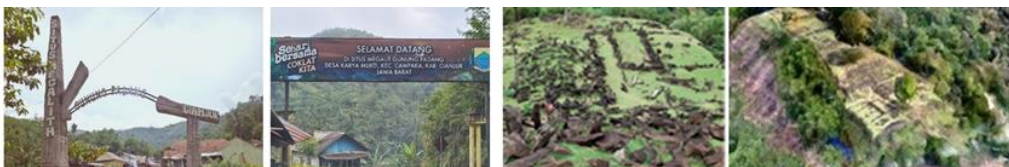
Figure 1. Site of Mount Padang Cianjur

The condition of the supporting attributes in the Gunung Padang tourist area is still very simple. The graphic info provided as a tourist map guide is also not interesting. There is no support for opening travel guides or travel brochures. Likewise, the 74 Hafizun Alim Foundation, which does not have a guidebook for Mount Padang is the Pillars of the Al Quran that can be distributed to Mount Padang tourists. Observing this situation, it is necessary for partners to get guidance and education regarding the provision of beautiful and attractive tourism attributes for tourists so that they can be more comfortable at the location.