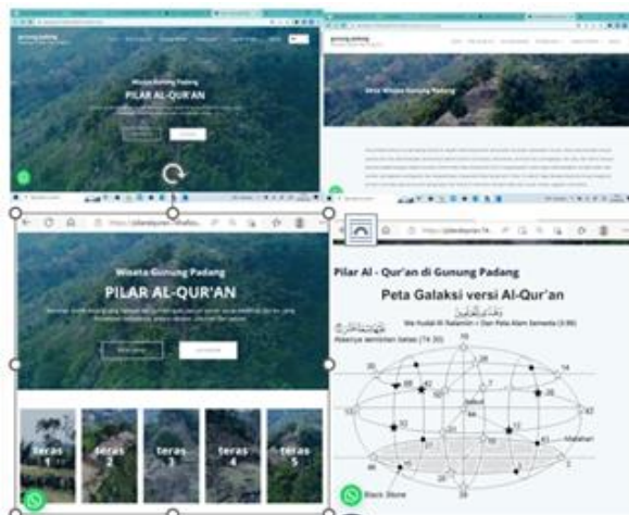
Figure 5. Website of the 74 HA Foundation, especially the Mount Padang Religious Tourism Expedition