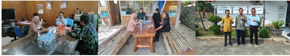
Figure 7. Permits to the Department of Tourism, Cultural Conservation and GP tour guides

that this activity has been permitted by the Tourism and Cultural Conservation office. This licensing process can be seen in Figure 7 below