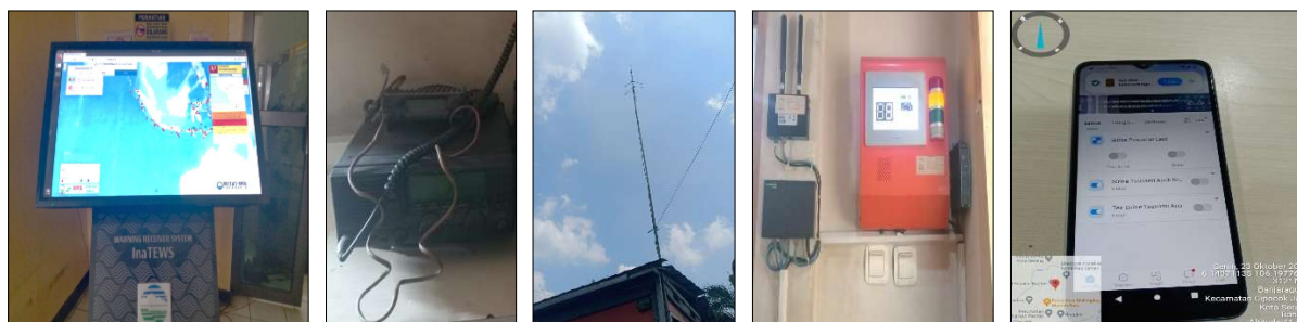
Figure 3. Dissemination technology and placement of sirens in Serang Regency

The list and distribution of existing siren placement locations can be seen in Figure 3 below.